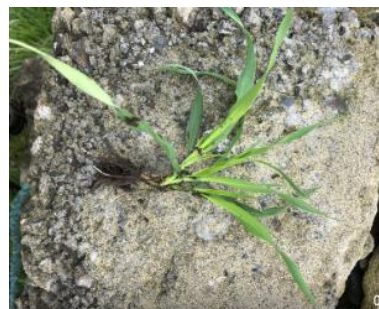
Salome 13 th May