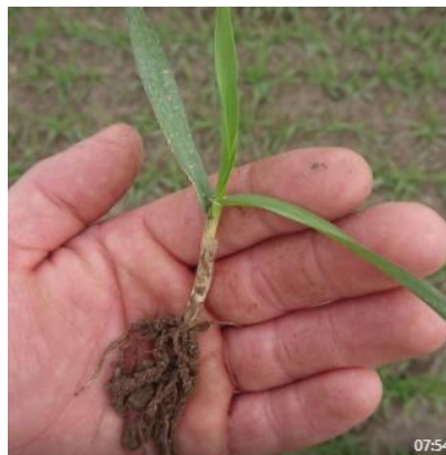
14 days after sowing