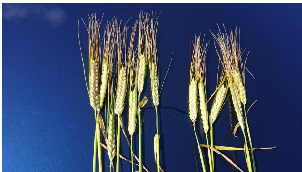
Scholland Shetland Harvest 3 rd September