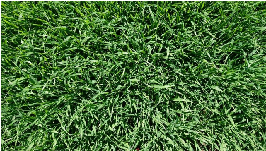
Shetland Salome – 16 th June 2019