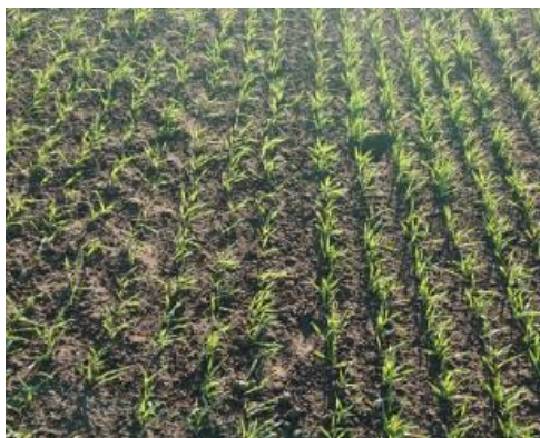
8 days after sowing