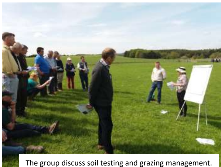
The group discuss soil testing and grazing management.