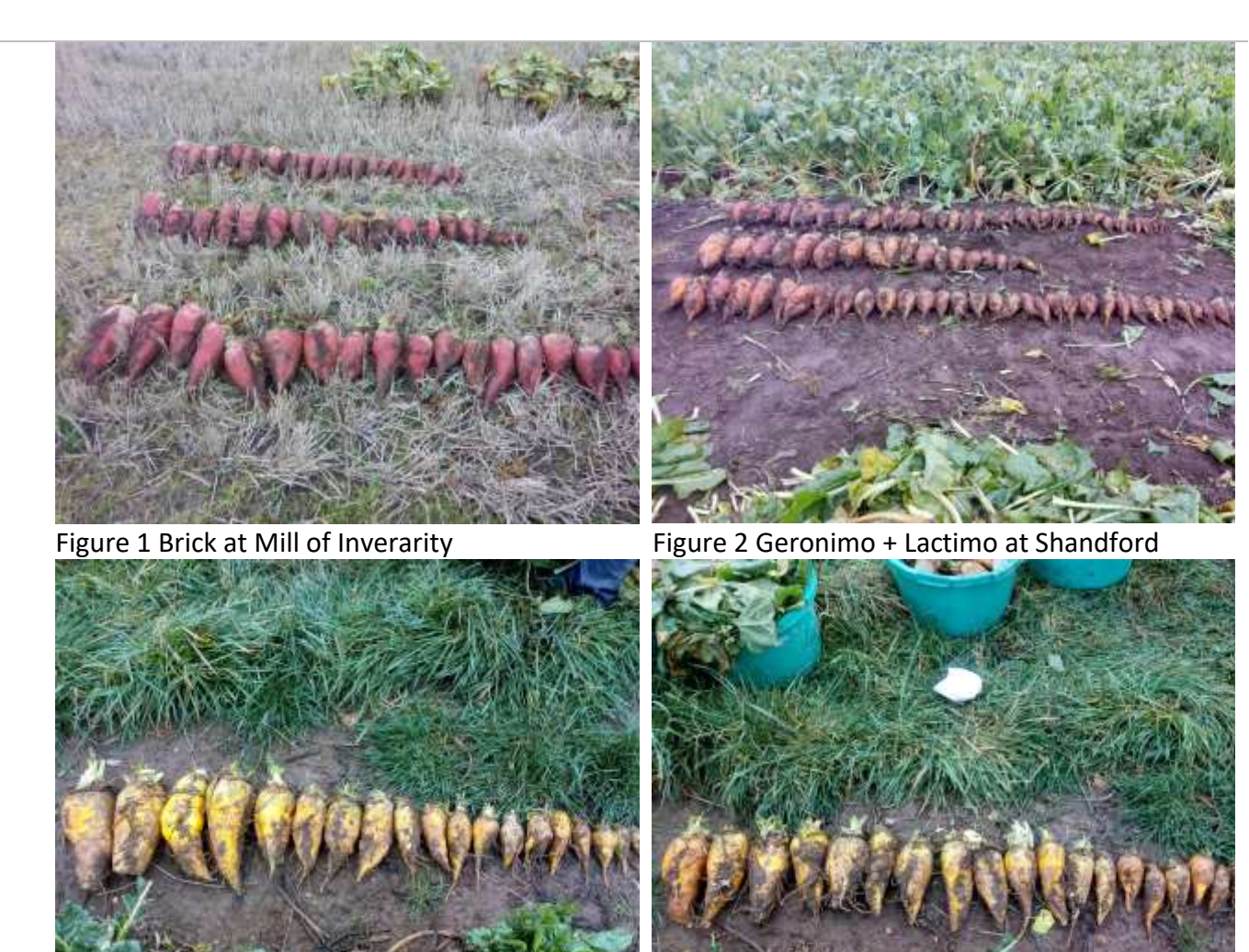
Figure 3 Bangor at Hillhead of Careston