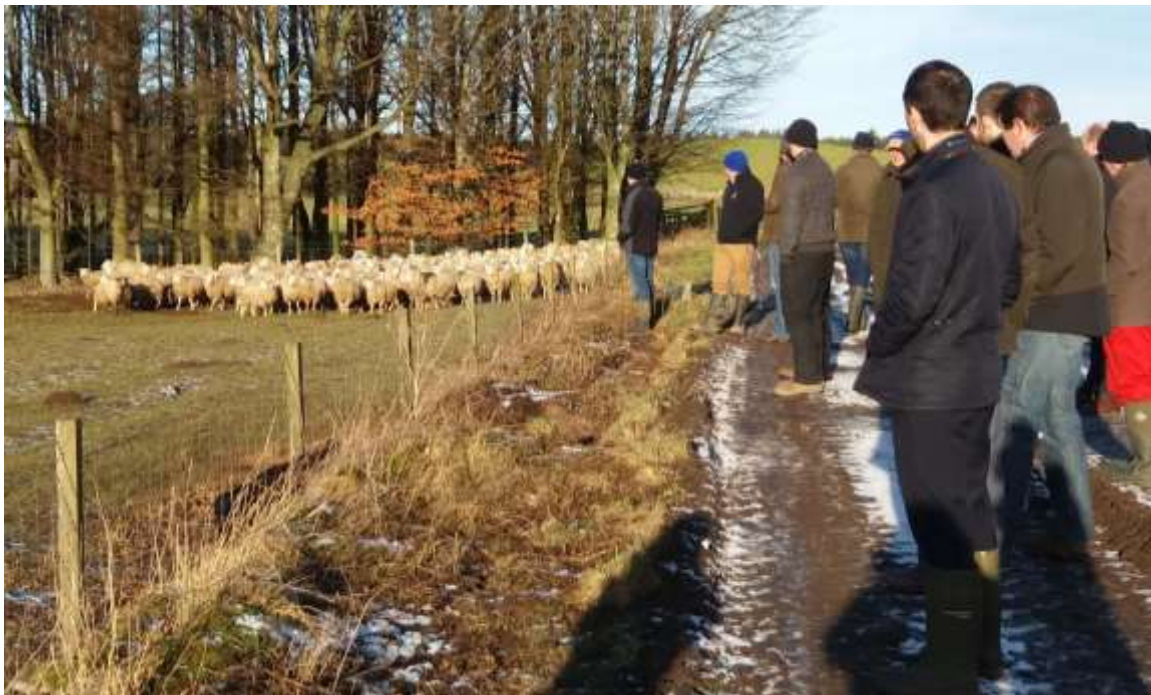
The Strone store lambs and the group discussing lamb finishing

Members of the community group were discussing the different types of winter grazing that could be used for putting lambs on to for finishing. Members of the management team already grow fodder beet for winter grazing, so going forward the Stodarts plan to trial different varieties of fodder beet, turnips and stubble turnips to look at options that give bulk and feeding quality for sheep over winter.